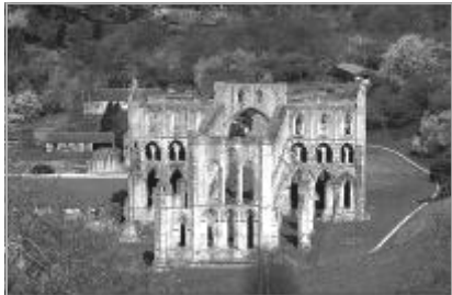
The tranquillity of Rievaulx Abbey

The suggested plan, which may well change later, is to go by train to York and spend a couple of days there with a guided walk round the city and a tour of the Minster one day.