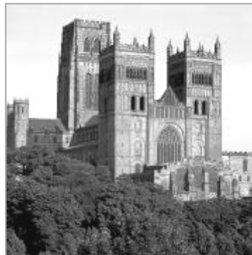
The greatest Norman building in Europe? Durham Cathedral

We would then drive by coach to spend some time on Holy Island before going to Durham for a couple of days.