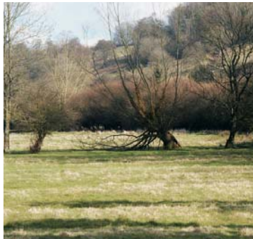
Willow trees by the River Kennet at Axford