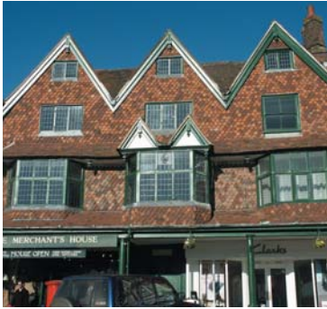
The Merchant's House c.1650, Marlborough