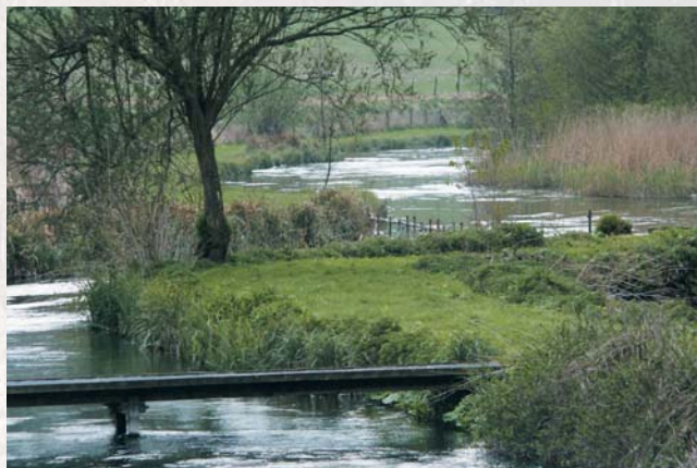
River Kennet at Stitchcombe, near Marlborough