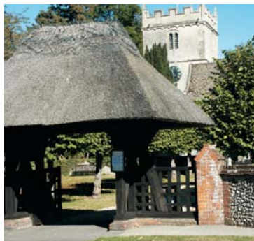
The lych gate, St Mary's Church, Chilton Foliat